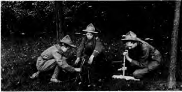
GETTING THE SPARK